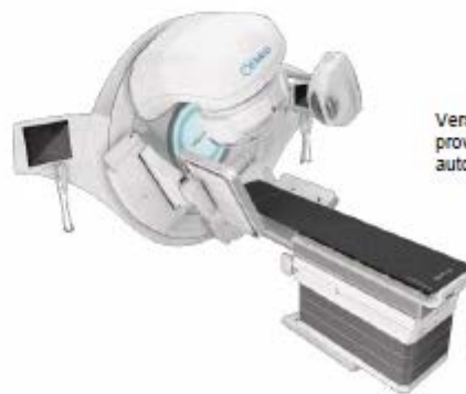
Versa HD – Elekta premium system provides stereotactic treatments with automatically guided accuracy

© 2024 GE HealthCare. GE is a trademark of General Electric Company. Used under trademark license.