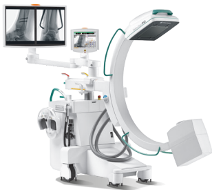
Solo FD 2121 & 3131

Elevating the benchmark within our industry, we proudly offer an unparalleled 36-month comprehensive warranty designed to provide you peace of mind protection on the following C-arms: