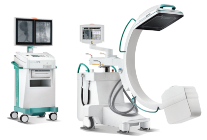
Vision RFD (non-motorized) 2121 & 3131