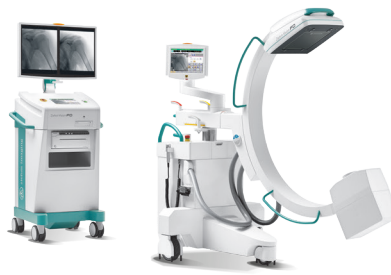
Vision FD 2121 & 3131