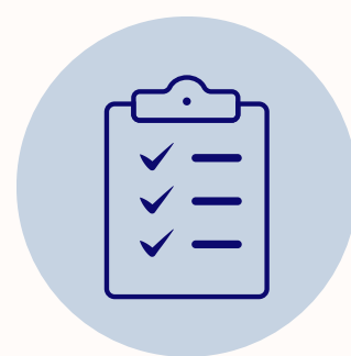
Post Knowledge Tests