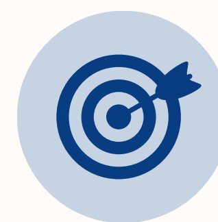
Targeted Training Tracks